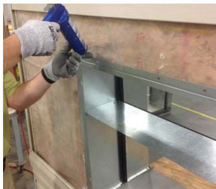
Caulk sides and top rails to building face.