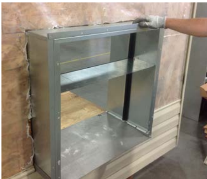
Insert sleeve into wall opening