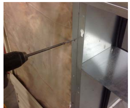
Screw to building face