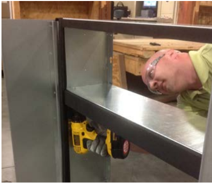
Attach side panels to sleeve base with screws and be sure to caulk. Then attach supply/return air divider and top panel.