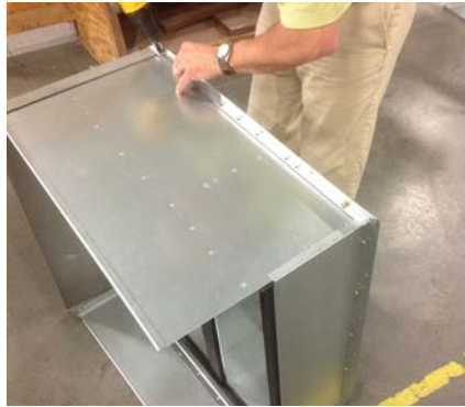
Attach Rails: Screw side rails to sleeve on top and both sides. Refer to installation instructions to set the appropriate depth.