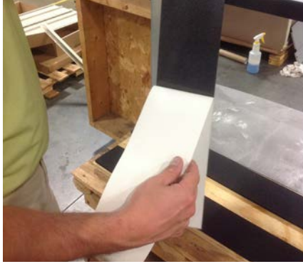
Peel and apply the three base pads as shown