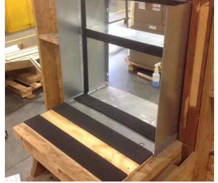
Finished base pan and gaskets