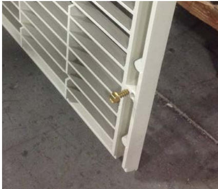
Start screws in louver to hang on key-hole slots