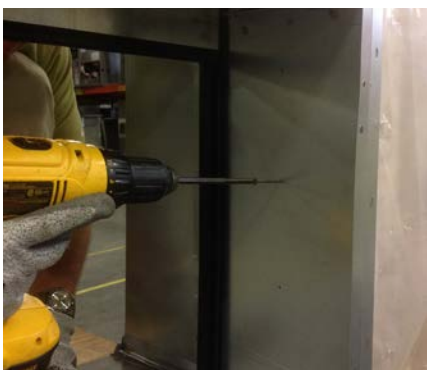
Also screw to side panels and base to frame