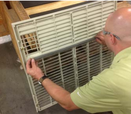
Attach the foam gasket to the back side of the louver to seal off the divider plate for supply/return air