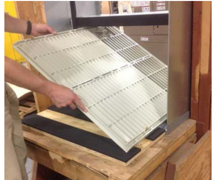
Pass louver through sleeve

Note: Tie rope to louver before passing through sleeve if there is no balcony to stand on.