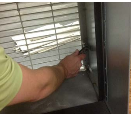
Screw louver in place

Note: Tie rope to louver before passing through sleeve if there is no balcony to stand on.