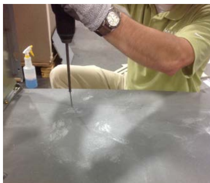
Bolt base to wooden platform